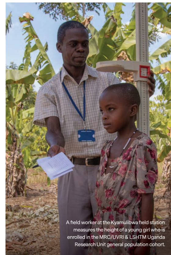
A field worker at the Kyamulibwa field station measures the height of a young girl who is enrolled in the MRC/UVRI & LSHTM Uganda Research Unit general population cohort.

This is a non-remunerated role that does not attract a salary or honorarium. Independent Members of Council will be able to reclaim all travelling and similar expenses incurred in the course of LSHTM business.