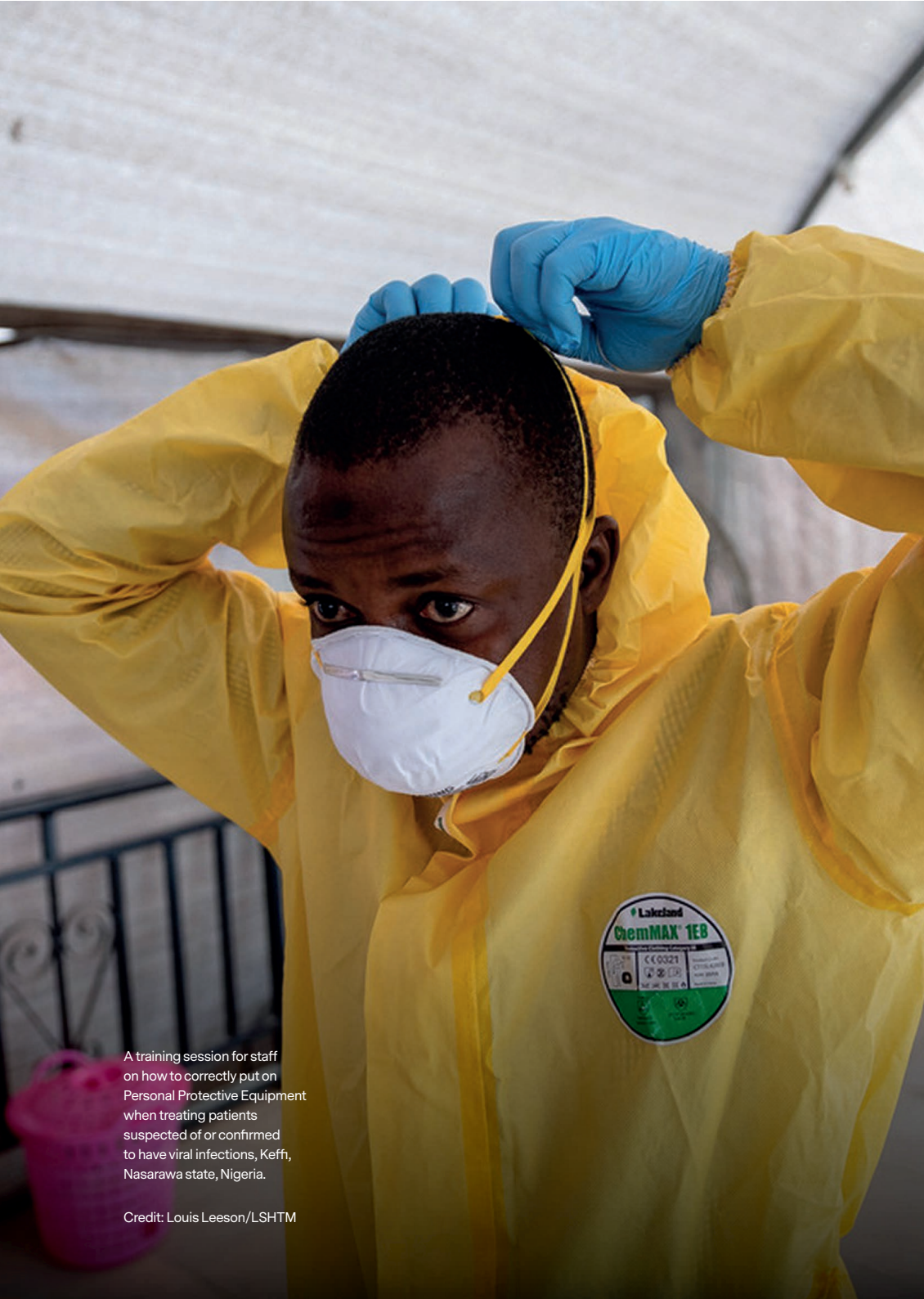
A training session for staff on how to correctly put on Personal Protective Equipment when treating patients suspected of or confirmed to have viral infections, Keffi, Nasarawa state, Nigeria.