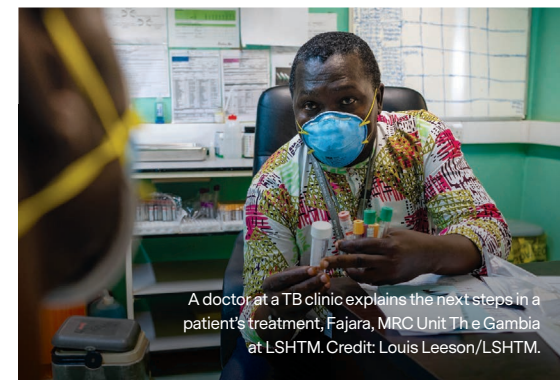
A doctor at a TB clinic explains the next steps in a patient's treatment, Fajara, MRC Unit The Gambia at LSHTM.