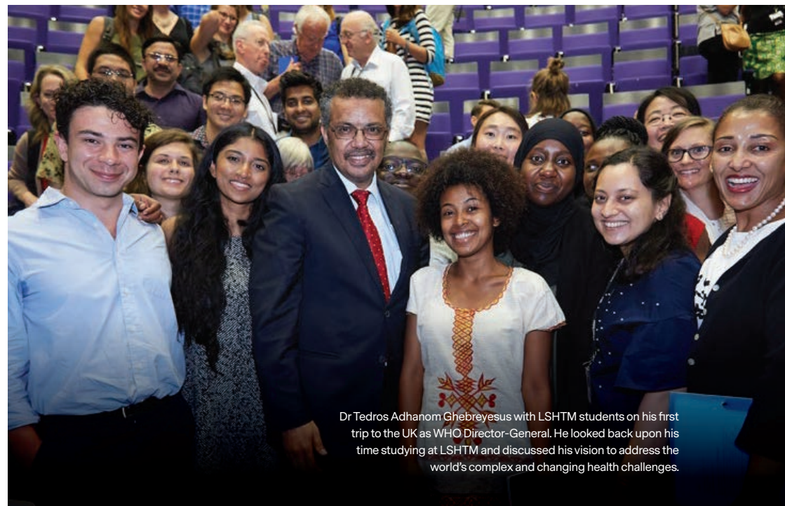
Dr Tedros Adhanom Ghebreyesus with LSHTM students on his first trip to the UK as WHO Director-General. He looked back upon his time studying at LSHTM and discussed his vision to address the world's complex and changing health challenges.

LSHTM is one of around 20 specialist institutions that receive institution specific funding from the Office for Students (OfS). This funding recognises the additional costs that LSHTM incurs because of its unique range of teaching, specialist facilities, and the scale of its contributions to national and international agencies.