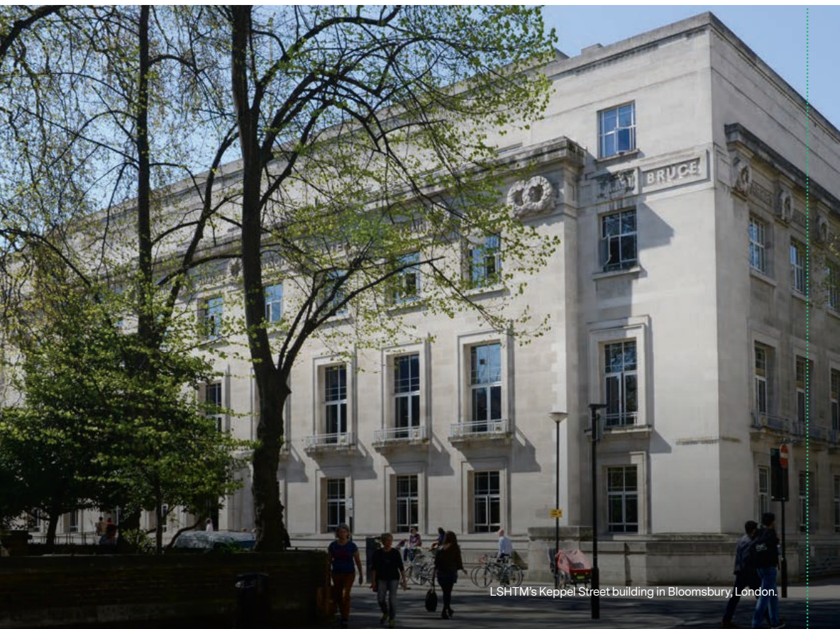
LSHTM's Keppel Street building in Bloomsbury, London.